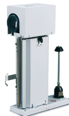
Pre-stretch film carriage