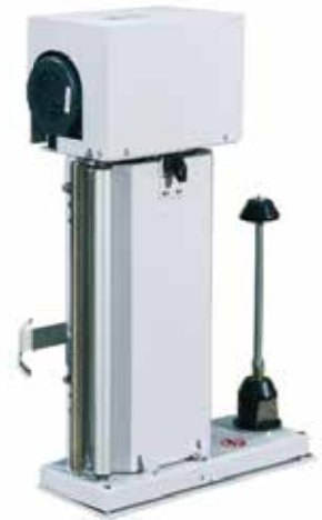
Pre-stretch film carriage